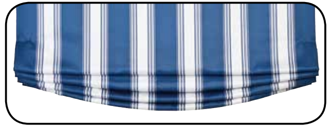
All valances feature four elegant fabric folds regardless of the height ordered.