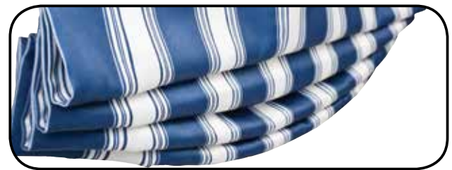
Valance measurements start from the top of the headrail to the center of the smile