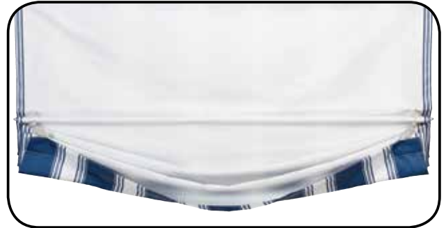
All valances are cord-free and clean to the streetside.