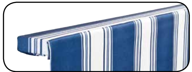
All boards are wrapped with matching fabric. Side tabs for Inside Mount valances is an option.